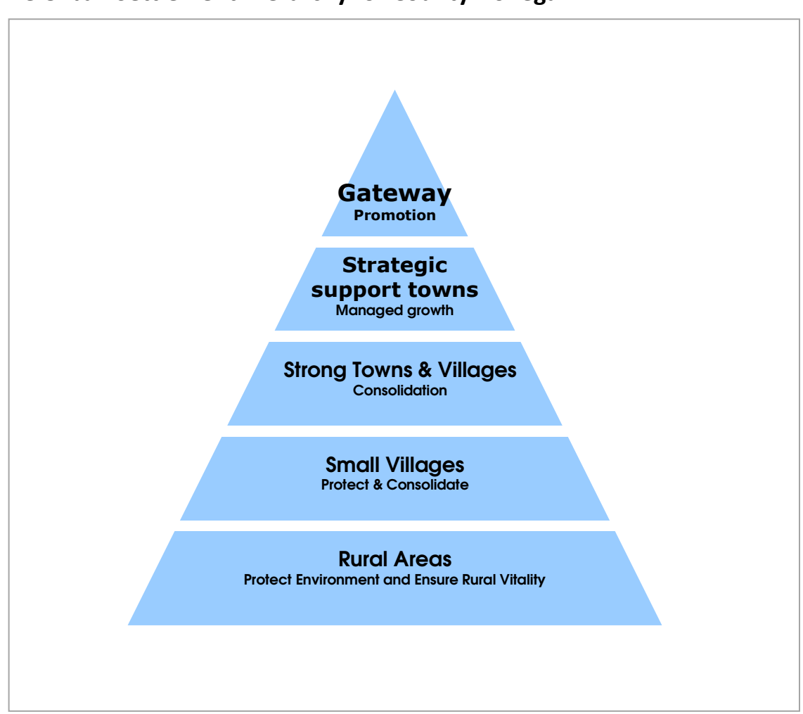
Appendix 6: The Urban Settlement Hierarchy for County Donegal.